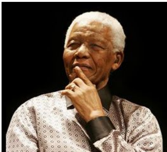
How to Join The Social Enterprise Movement