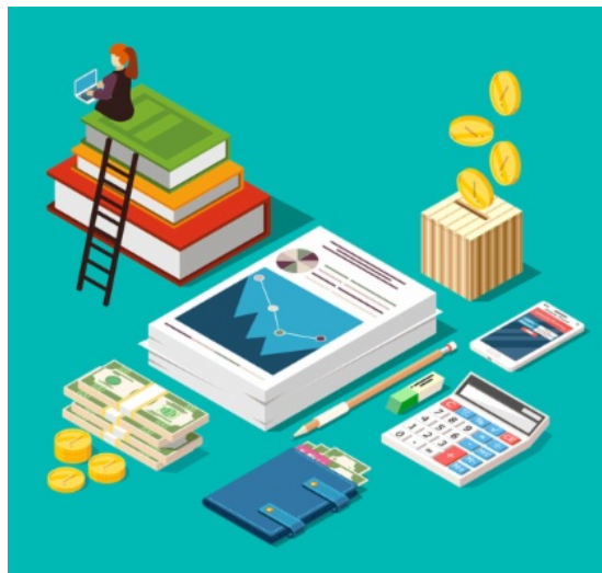
Don't Ignore This Nonprofit Advice