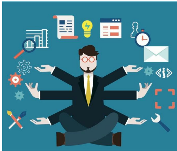
Social Enterprise Resource Round-Up